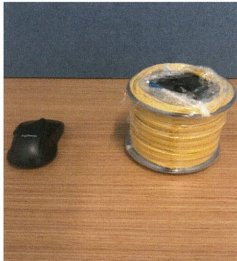
Fig. 1. NASDAQ-SM-100M-Reel 100 Meters SM NASDAQ SPEC

The actual physical cable the Exchanges use in their data centers to provide direct access to their systems is not unique or specialized from a technology standpoint. In fact, it is widely available from various vendors. Virtu obtained a quote from a vendor and purchased the very same cable for $189.50. As noted on the invoice pictured below, the cable is described as “NASDAQ-SM-100M-Reel 100 Meters SM NASDAQ SPEC” and is pictured below ( figures 1 & 2 below ). Virtu was also able to purchase the same cable on Amazon for a mere $87.95. Using the Amazon price, Virtu could purchase 13,507 of these cables (which are 328 feet in length) and string a line of continuous cable from Nasdaq’s data center in Carteret, New Jersey to the CME Group Data Center in Aurora, Illinois and have enough cable left to traverse to Madison, Wisconsin.